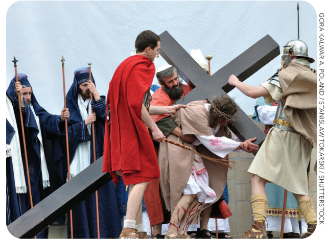
GORA KALWARIA, POLAND