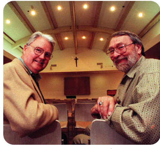
A candidate and his sponsor sit for a photo after an Order of Christian Initiation for Adults (OCIA) class.

I would also recommend that you "beef up" your understanding of what it means to be a practicing Catholic. You might do this by participating in your parish's process for the Christian Initiation of