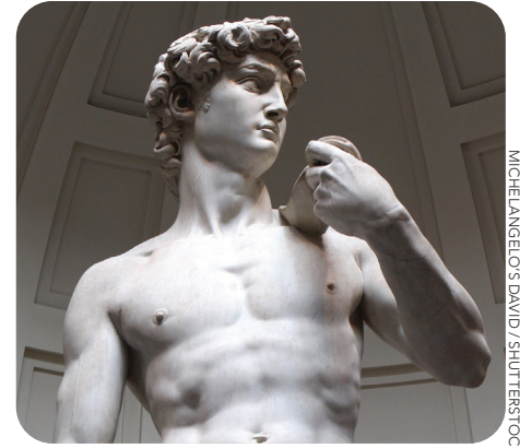
MICHELANGELO'S DAVID

From this document: “Using and/or producing pornography is a sin against chastity and against human dignity... The sin of pornography needs the Lord’s forgiveness and should be confessed in the sacrament of penance. Pornography objectifies people and brings hurt and pain. It is an illusory substitute for real relationships and intimacy, which in the end bring true joy. Many good people struggle with the sin of pornography and [strive] to cultivate chastity. You are not alone. Jesus is with you, the Church offers you love and support. Trust in the Lord’s mercy and his power to free and heal you.” ●